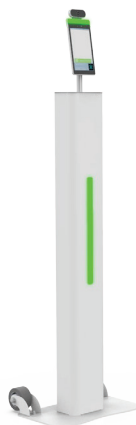
Pedestal with Optional Battery, LED & Casters